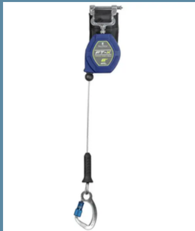
82808SP6 8' CLASS 2 LE CABLE