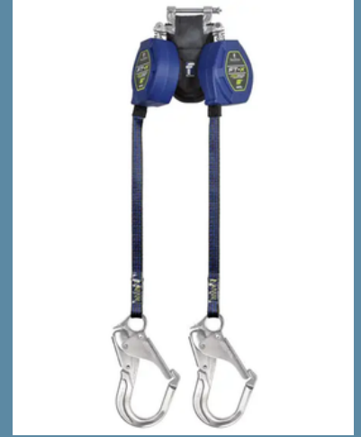
84108TP5 8' CLASS 2 LE EDGECORE