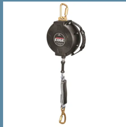
727650LE 50' GALVANIZED STEEL CABLE