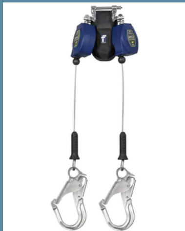
82808TP5 8' CLASS 2 LE CABLE