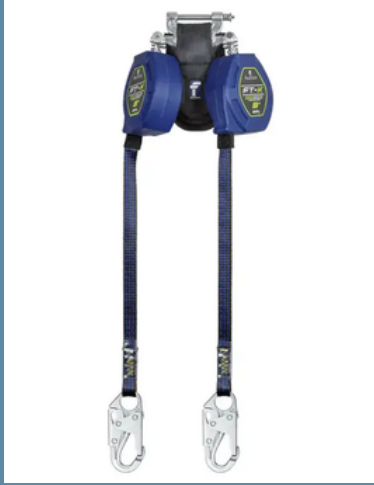
84108TP0 8' CLASS 2 LE EDGECORE