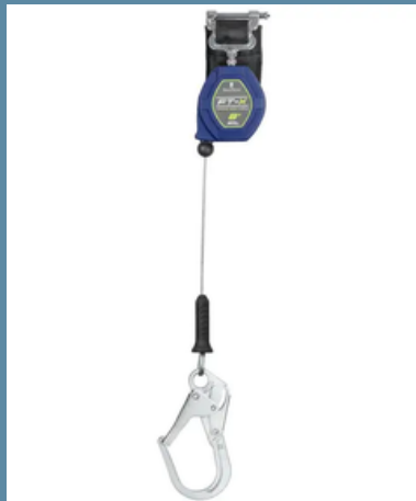
82808SP5 8' CLASS 2 LE CABLE