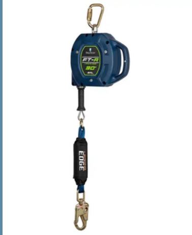
721530LE 30' GALVANIZED STEEL CABLE