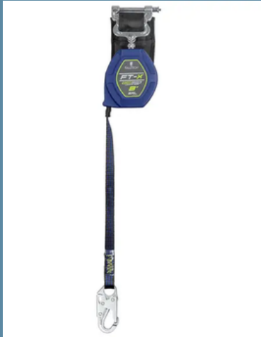
84108SP1 8' CLASS 2 LE EDGECORE