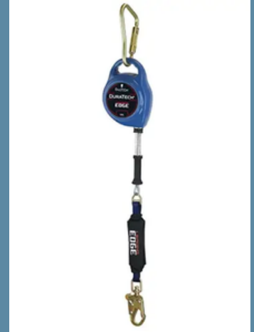
7232CLE 30' GALVANIZED STEEL CABLE