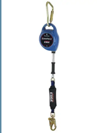
7227CLE 20' GALVANIZED STEEL CABLE