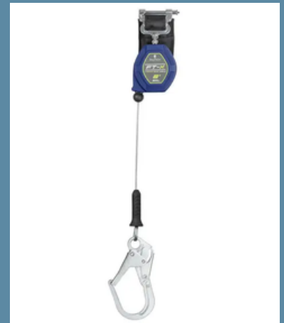
82808SP3 8' CLASS 2 LE CABLE