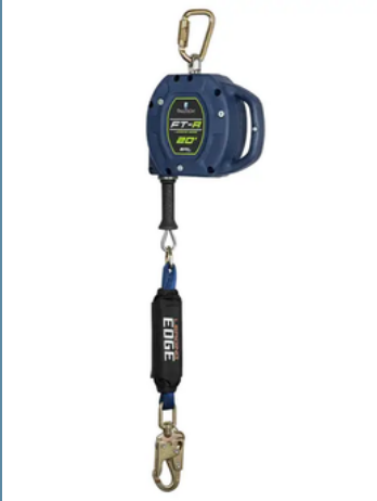
721520LE 20' GALVANIZED STEEL CABLE