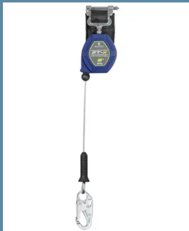
82808SP1 8' CLASS 2 LE CABLE