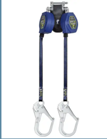
84108TP3 8' CLASS 2 LE EDGECORE