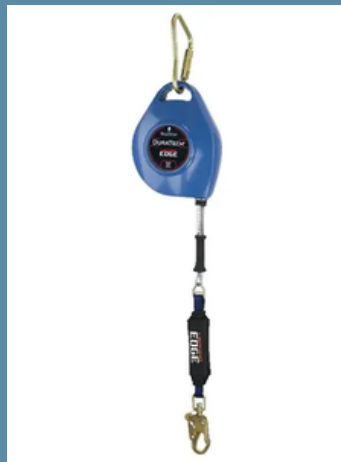
7268CLE 50' GALVANIZED STEEL CABLE