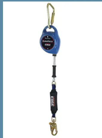
7265CLE 60' GALVANIZED STEEL CABLE