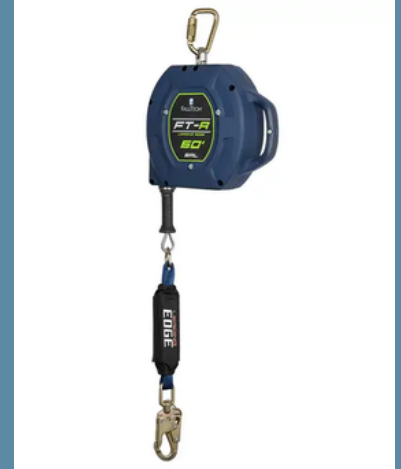
721560LE 60' GALVANIZED STEEL CABLE