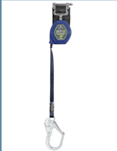
84108SP3 8' CLASS 2 LE EDGECORE