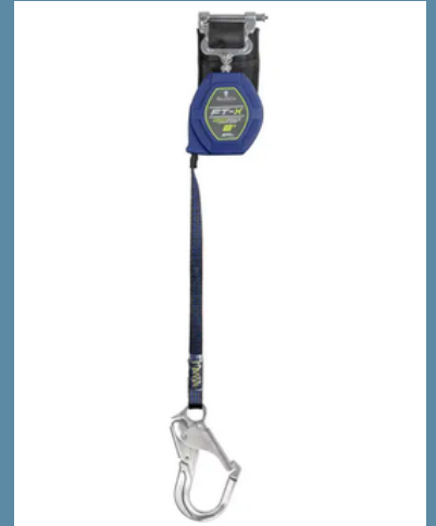
84108SP5 8' CLASS 2 LE EDGECORE